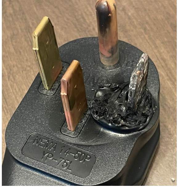
34. Defendants were aware of concerns about the PMC+ and PMCC overheating since at least August 19, 2022, when they circulated a service bulletin to their authorized technicians explaining the problem.<sup>29</sup> Over the next month, Defendants updated the bulletin several times, with the most recent iteration containing technical information published September 21, 2022.<sup>30</sup>